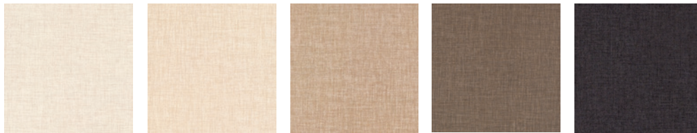
Arctic Tan Sand Jute Midnight Black

Sizes Available: 12"x24", 24"x24", Matchstick 3/8"x6" Mosaic on 12"x12" Mesh Sheet, 3.25"x12" BN