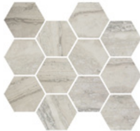
3.25" Hex Mosaic on 10"x11.50" Mesh Sheet Available in all colors