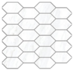
2"x4" Diamond Blend Mosaic Mosaic on 10"x11.5" Mesh Sheet