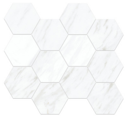
3.25" Hexagonal Mosaic on 10"x11.5" Mesh Sheet Available in Matte & Polished Finish