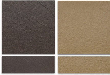
Opal 24"x24" (600x600mm) 12"x24" (300x600mm) Caramel 24"x24" (600x600mm), 12"x24" (300x600mm)